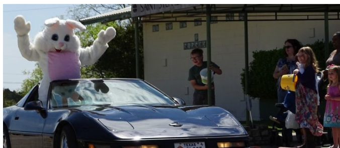
The Easter Bunny arrives in style!