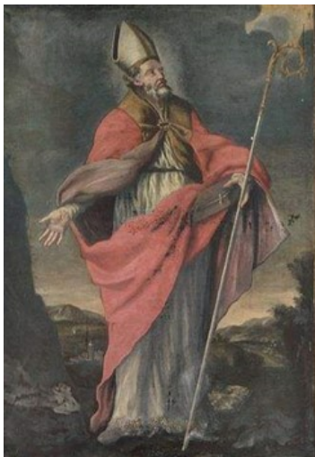
Image from the Church of St. Anselm, Bomarzo, Italy

His other scholarly works include the Monologion (1075–76), and his four philosophical dialogues: De grammatico (1059–60), De veritate, De libertate arbitrii, and De casu diaboli (1080–86). He was called to England in 1093 to become the Archbishop of Canterbury, and his years there were rife with political controversy. He had the courage to stand up to both William II and Henry I regarding ecclesiastical abuses that were being carried out by the kings on the Church. He became a major figure in the conflict over whether secular rulers or a pope should have the principal right to invest religious authority, such as a bishop, with the symbols of his office. He was also a defender of the Church against kings’ encroachments on its rights, liberties, and church lands. He was banished twice for making appeals in Rome. Saint Anselm was canonized by Pope Alexander VI in 1494. His feast day is commemorated on April 21st.