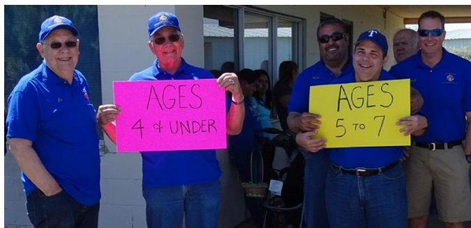
Sorry guys, this does not apply to you! You are off by a few decades.....at least!