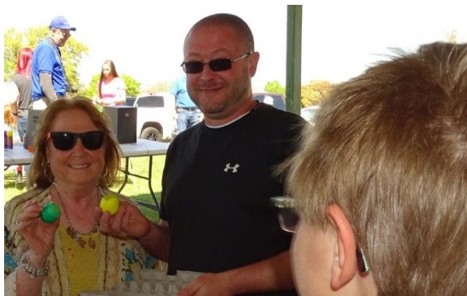
You two are definitely up to something!!!