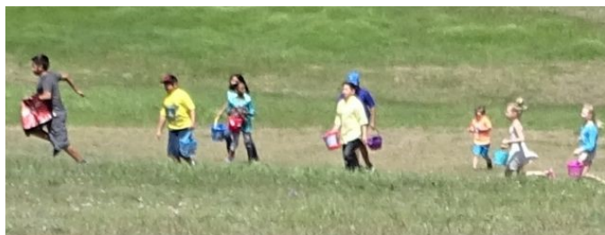
On your mark, get set, GOOOOOO!